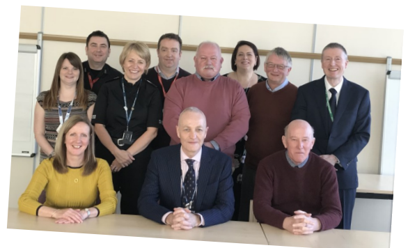
The Community Justice Partnership March 2018

The fuller plan can be found here: 2018 21 plan v4.pdf (highlandcpp.org.uk)